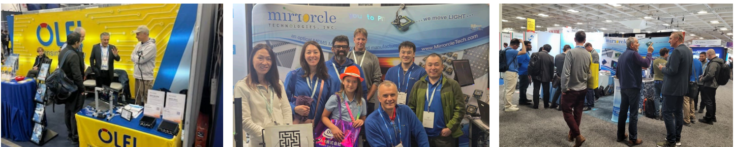
Figure 1: Mirrorcle teams at CES 2026 and Photonics West 2026 exhibitions.

For Mirrorcle Technologies, 2026 started with two successful exhibitions, namely CES in Las Vegas and SPIE Photonics West in San Francisco. The company was represented in booths at both shows and drew many visitors, both new prospective clients as well as established customers, vendors and collaborators. As the company is officially celebrating its 21 st birthday this month, Mirrorcle looks back at as many years of growth and continuous improvement and expansion of world-leading MEMS mirror manufacturing. Some of the key novelties at the three shows included a new set of single-axis resonant MEMS mirrors for highest-speed controlled line-scanning applications, novel packaging solutions targeting both miniaturization and further improvements on mass reduction and compactness as well as tailored solutions for space applications and others that require hermetically sealed packaging options. This wider portfolio of products serves an ever-increasing depth and broadening of customers across many industries – all of whom leverage the gimbal-less MEMS mirror design that makes the Mirrorcle products unique.