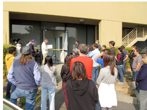
Figure 1. Mirrorcle laser-cuts ribbon to new cleanroom facility using a new product 1W blue laser (450nm) Scan Module. A crowd of visitors witnesses ribbon-cutting spectacle.